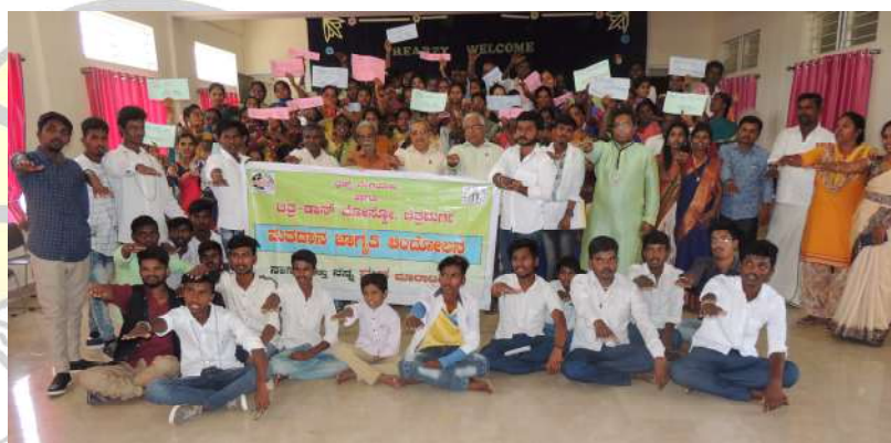
Batch Summary of DB Tech Students in the Year 2018-2019

The scheme is instrumental in providing livelihood skills to the youth and main streaming opportunities in the sunrise sectors of the economy. They are molded with soft skills, technical skills, work readiness, social audits, etiquettes, initially hand holding and tracking them till they feel confident to carry on. In the year 2018-2019, 3 batches were trained (25 th , 26 th & 27 th ).